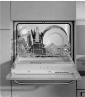
600 w × 480 d × 460 h fully integrated 'compact' dishwasher for 6 place settings – by AEG