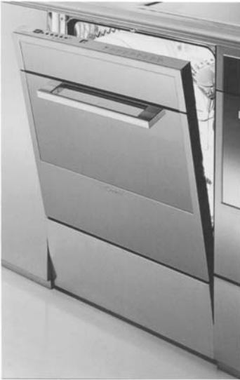
600 mm wide semi-integrated dishwasher with SS door for 12 place settings – by Candy