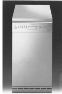
450 mm wide freestanding dishwasher for 9 place settings in SS – by Smeg